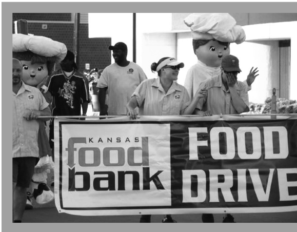
The Campbell's Kids and postal workers participate in the River Festival Sundowner's Parade.