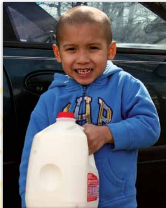
Kids can grow up strong and healthy thanks to you.