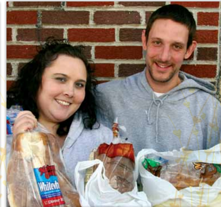
Families in need are grateful for your help.