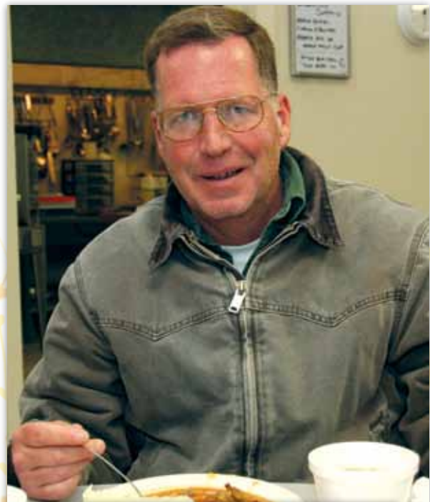
You're feeding Kansas of all ages.