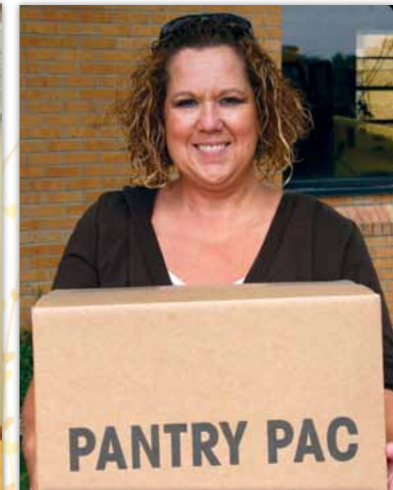
You're putting food on the table for Kansas families.