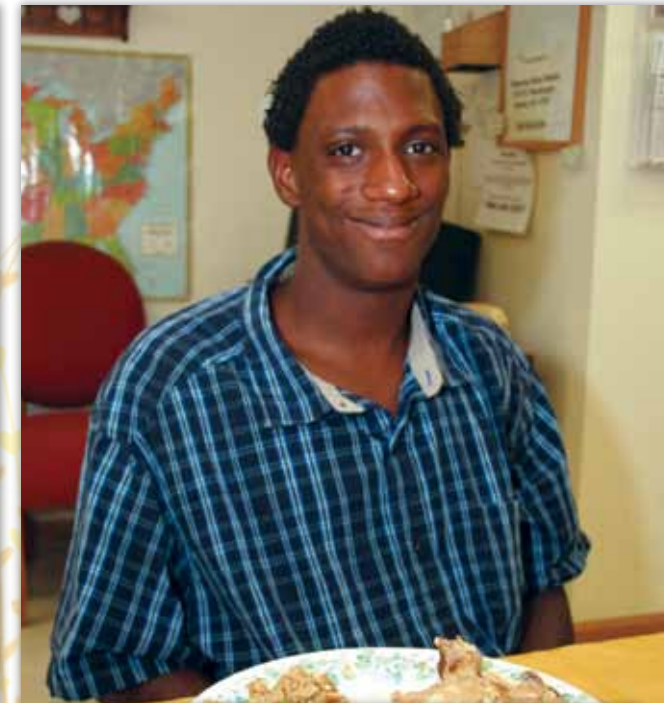
Thank you for helping our hungry neighbors.