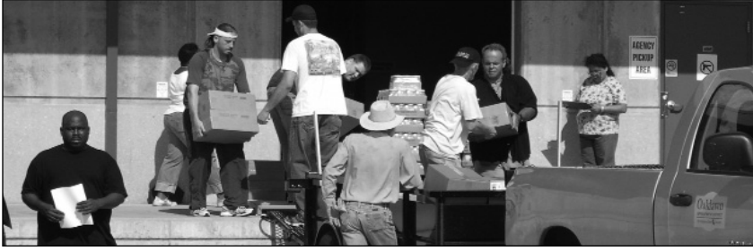
Pantry volunteers load a food order at the Kansas Food Bank.